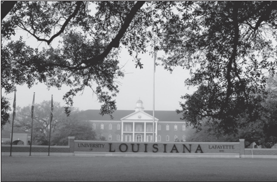
Louisiana Welcome Wall