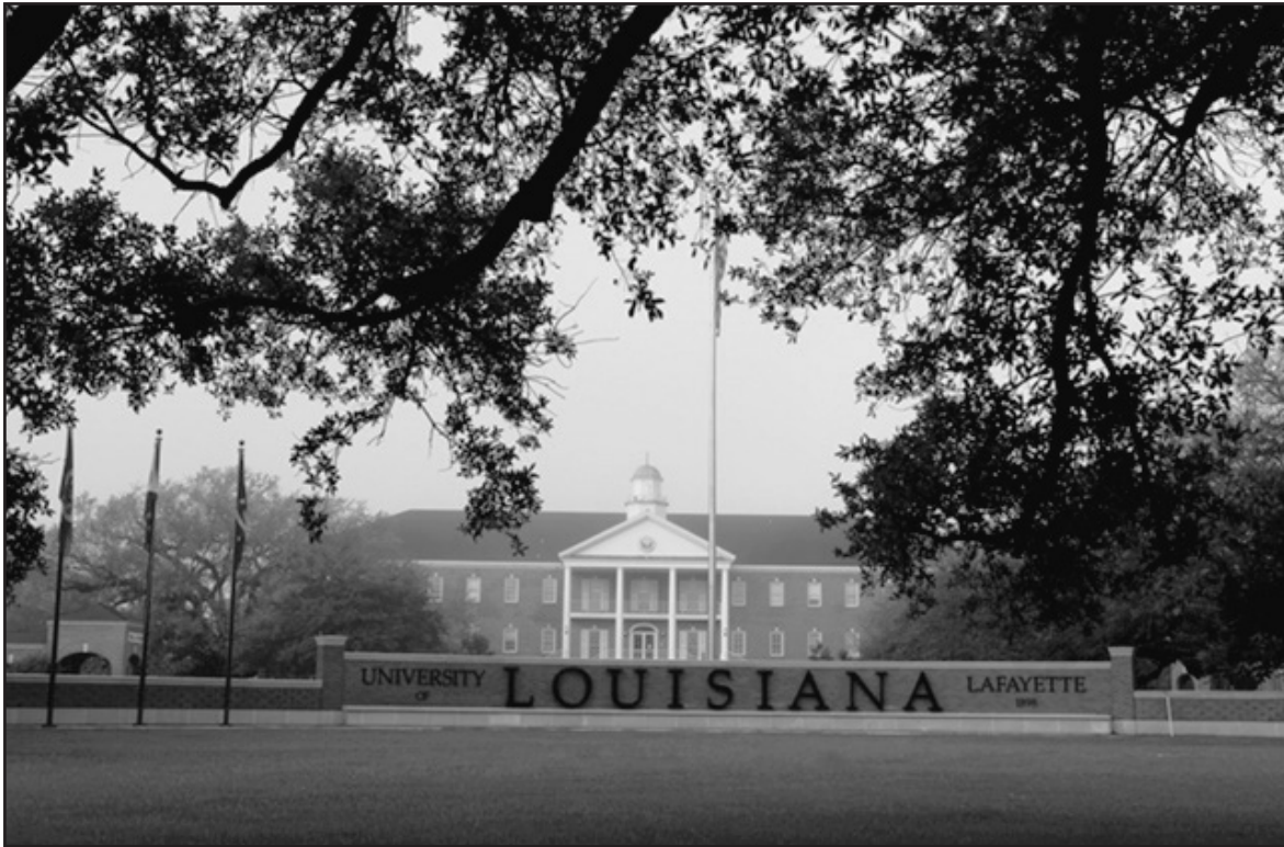
Louisiana Welcome Wall