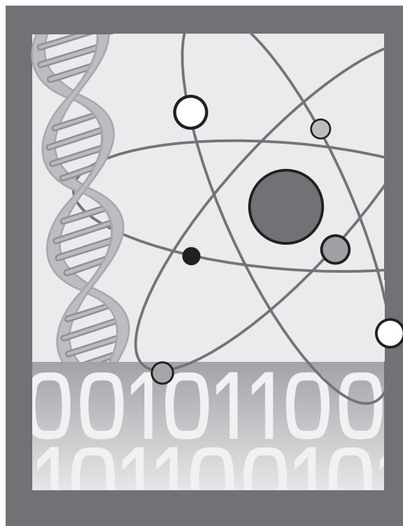
Symbols of the basis of scientific theory and application provide visual elements to represent this college. The stylized atom visualizes the basic building block of all computer codes.